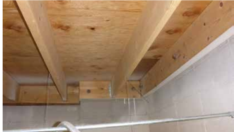
Figure 1. Wood diaphragm connections and shear walls not visible from the top surface of the diaphragm.

To the authors' knowledge, nothing similar to this provision existed in any of the three model codes or other documents that served as the primary basis for the first edition of the IEBC. Furthermore, nowhere in the June 2001 Working Draft of the 2003 IEBC, prepared by the 2003 IEBC Drafting Committee, was there any mention of structural evaluations and/or upgrades to roof diaphragms associated with reroofing. As such, it was surprising that this provision appeared in the August 2001 Final Draft of the 2003 IEBC, also prepared by the 2003 IEBC Drafting Committee. It was subsequently learned from International Code Council (ICC) Technical Services that, based on recollections of certain ICC staff, the drafting committee reportedly had "concerns about the working draft and the lack of protection for high wind, and the focus was on the connections because they were often the cause of failures in high winds." Unfortunately, it appears that there are no meeting minutes or other written records