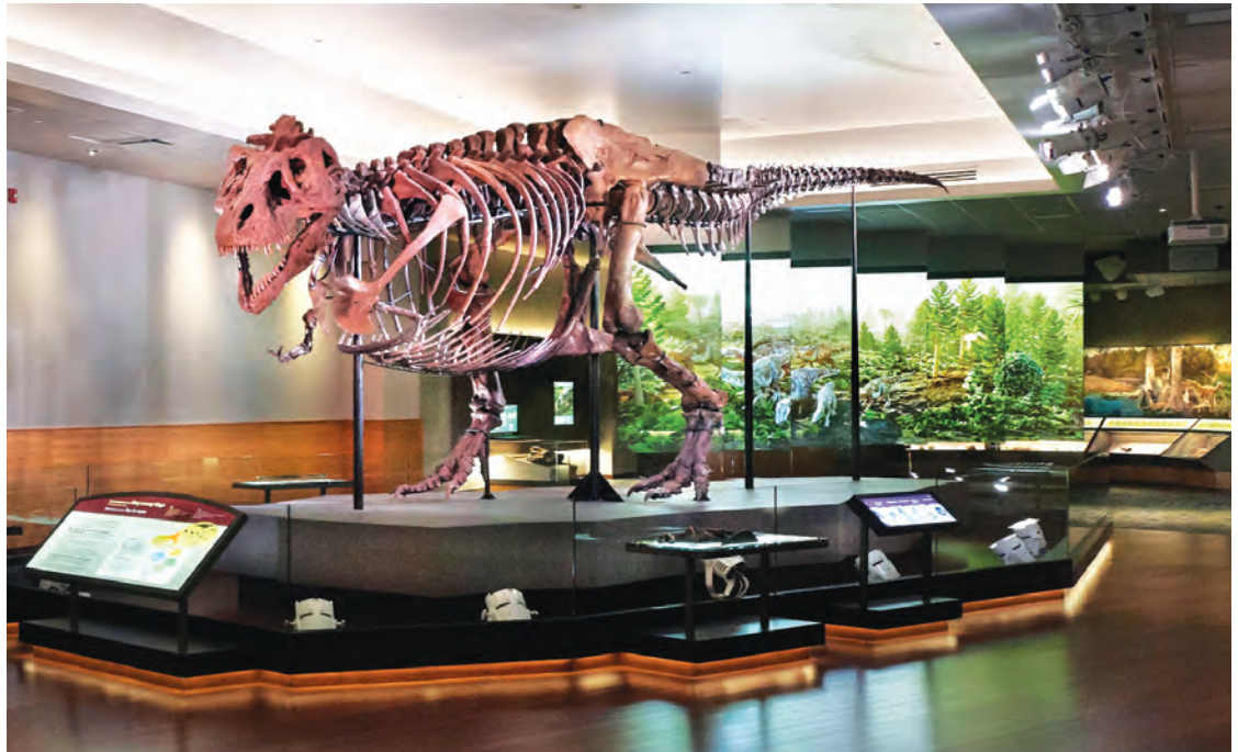
Fig. 1. Completed SUE Hall, Field Museum, Chicago, Illinois, soon after public opening, with sound show and digital animations on glass screens in background. Photograph by John Weinstein, 2018. © Field Museum of Natural History GN92620_092B.

How to settle down your Tyrannosaurus rex before you take it out in public: vibration-mitigation design for a 67-million-year-old museum specimen.