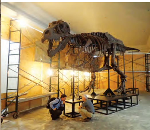
Fig. 2. SUE showing nearly complete reassembly at its new second-floor location when vibration concerns were first identified.

“SUE” is the most complete Tyrannosaurus rex specimen in the world, with approximately 90 percent (by volume) of its actual bones mounted for exhibit. The specimen was discovered in 1990 in western South Dakota from the Hell Creek Formation dated approximately 67 million years old. The Field Museum in Chicago, Illinois, acquired the specimen, catalog no. PR 2081, now one of the most valuable objects in the museum’s collection, in 1997 for $8.3 million. From the outset, the museum intended to mount the real bones, not facsimiles, and hired a specialist to produce an intricate steel armature constructed in such a way that the bones could be removed for study. All mounts of real dinosaur bones are fragile, and this one particularly so because of its complexity.