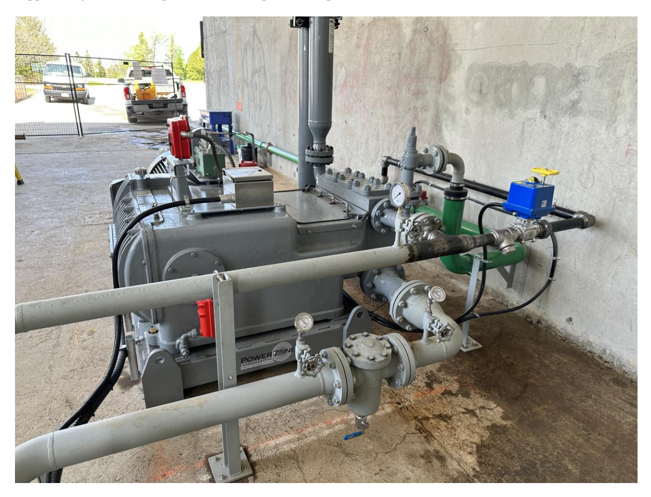
Figure 8 New 150 hp Pump for Single Chamber Operation

The lock was initially operated after the incident using small electrically driven pumps to provide water to move the single chamber. These pumps are used during normal operation to "trim out" the level of the locks and typically provide only small amounts of water. These pumps required over 4 hours to complete one operation of the locks. As such they were not suitable for other than incidental use. However, as the water hydraulic piping supported this type of operation already, larger water hydraulic pumps were considered as replacements to increase the speed of the chamber operation. After some study, it was decided that a temporary operating plan centering on providing a 150hp, electrically driven pump to support single chamber operation was the preferred option.