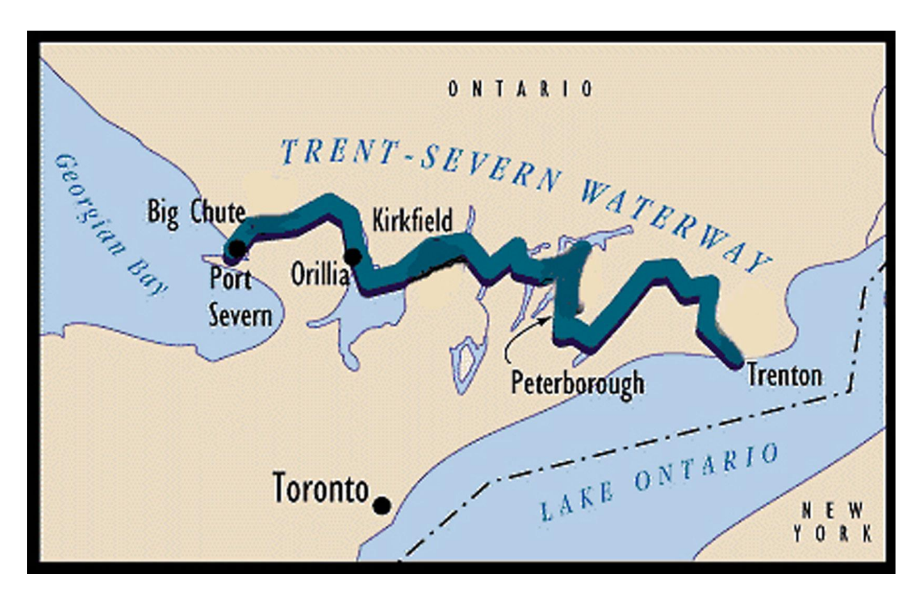
Figure 2 Trent-Severn Waterway map

The waterway and the lock itself are of great historic significance.