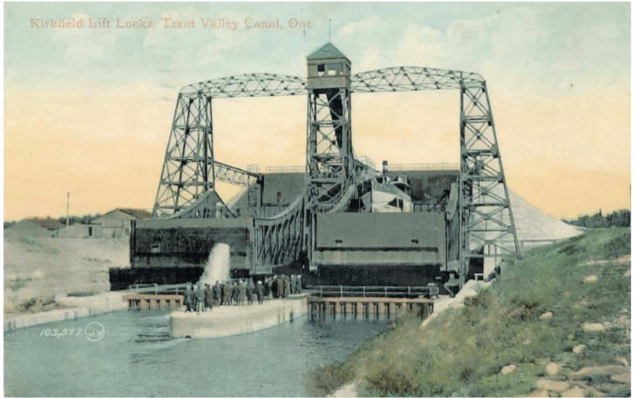
Figure 1 Kirkfield Lift Lock circa 1907

The Kirkfield lift lock is a large moving structure located in Kawartha Lakes, Ontario, Canada.