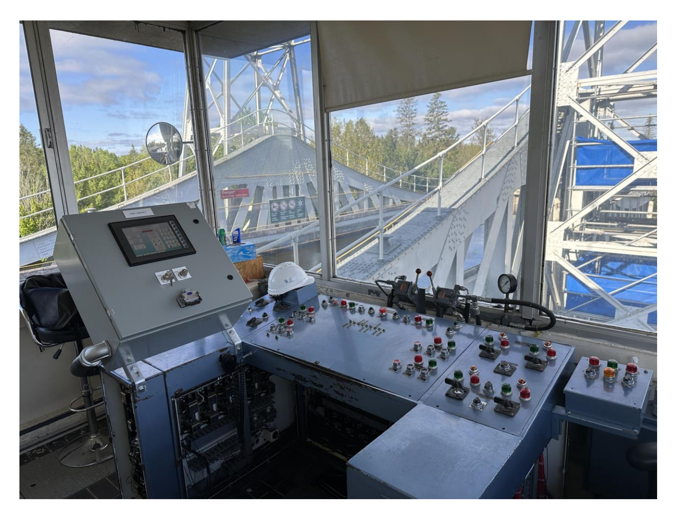
Figure 10 Piggyback control system mounted on existing control desk.

The solution was expected to provide flexibility to accommodate changing system requirements and reduce overall wire counts. Quicker installation and return to normal operation were also benefits of this approach. Additionally, this solution met all the design criteria including limiting retraining.