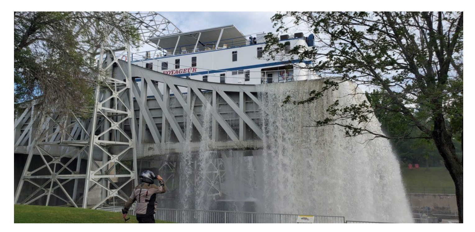
Figure 7 Incident at Kawartha Lift Lock September 3, 2022.

At the time of the incident, the vessel was in the process of locking through from the north chamber to the upper reach. While the upper reach and chamber gates were open, the north chamber began moving in the absence of a controlled Lockmaster input. This incident resulted in damage to various components associated with the operation of the north chamber. In addition, during the recovery efforts, the lower level of the lift lock structure was flooded with several feet of water