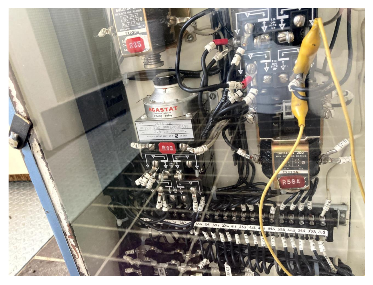
Figure 5 Portion of Relay Based Lock Control System.

3. Converting the water driven pumps to electrically driven motors and pumps.