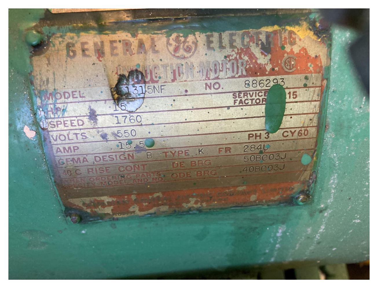
Figure 6 Water Hydraulic Pump Motor

The power and control systems had reached the end of their useful service lives at the time of the incident.