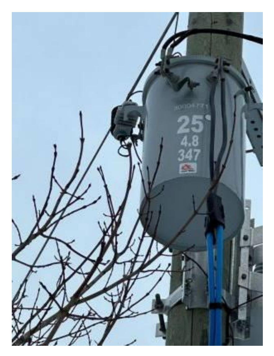
Figure 9 Electric service transformer prior to upgrade which was inadequate to support 150hp operation.

2. The existing relay-based control system was not designed to allow for single chamber operation.