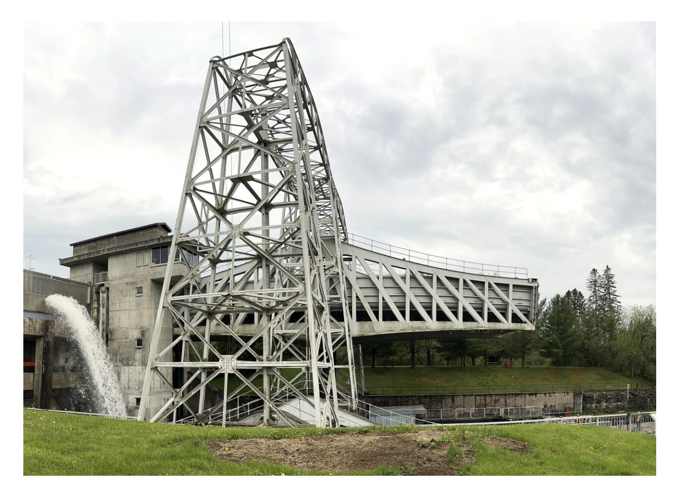
Figure 4 – Kirkfield Lift Lock 2024

2. Converting the original control system to a relay-based control system centrally located in the Operator's House.